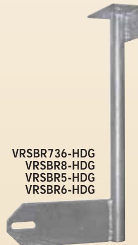
VRSBR736-HDG VRSBR8-HDG VRSBR5-HDG VRSBR6-HDG