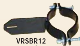
VRSBR12 and VRSBR13